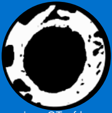
micro CT of bone drilled with K-wire