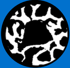
micro CT of bone after SmartShot microneedling

SmartShot enables marrow stimulation with 1mm diameter channels, allowing for minimal surface and subchondral disruption. The result is marrow stimulation with improved healing and patient recovery.